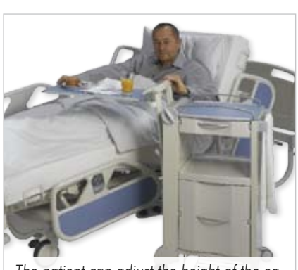
The patient can adjust the height of the eating board using just one hand.