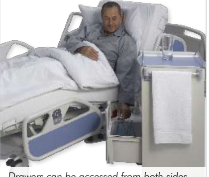
Drawers can be accessed from both sides allowing easy patient access.