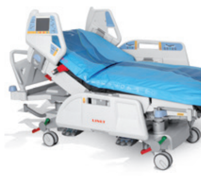
OptiCare® with integrated design.