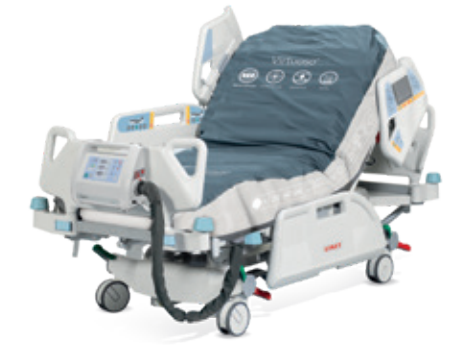
Virtuoso® with "Zero Pressure" and 3-cell technology.

The open architecture of the Multicare® bed allows for use of various mattress systems for prevention and as a treatment support of pressure injuries according to the needs of the patient.