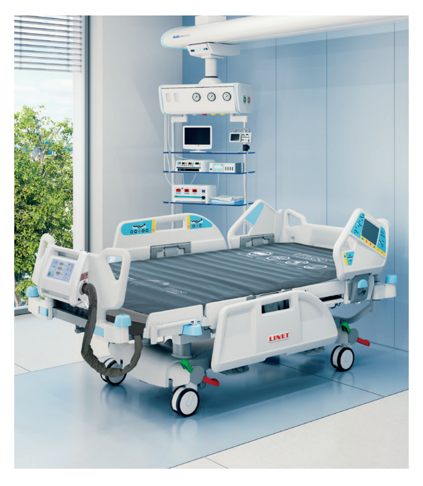
Critical Care Bed